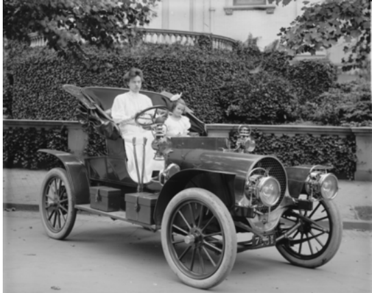
Figure 1: 1907 Franklin Model D roadster.

identifying features of a reference should be included: title, year, volume, number, pages, article DOI, etc.